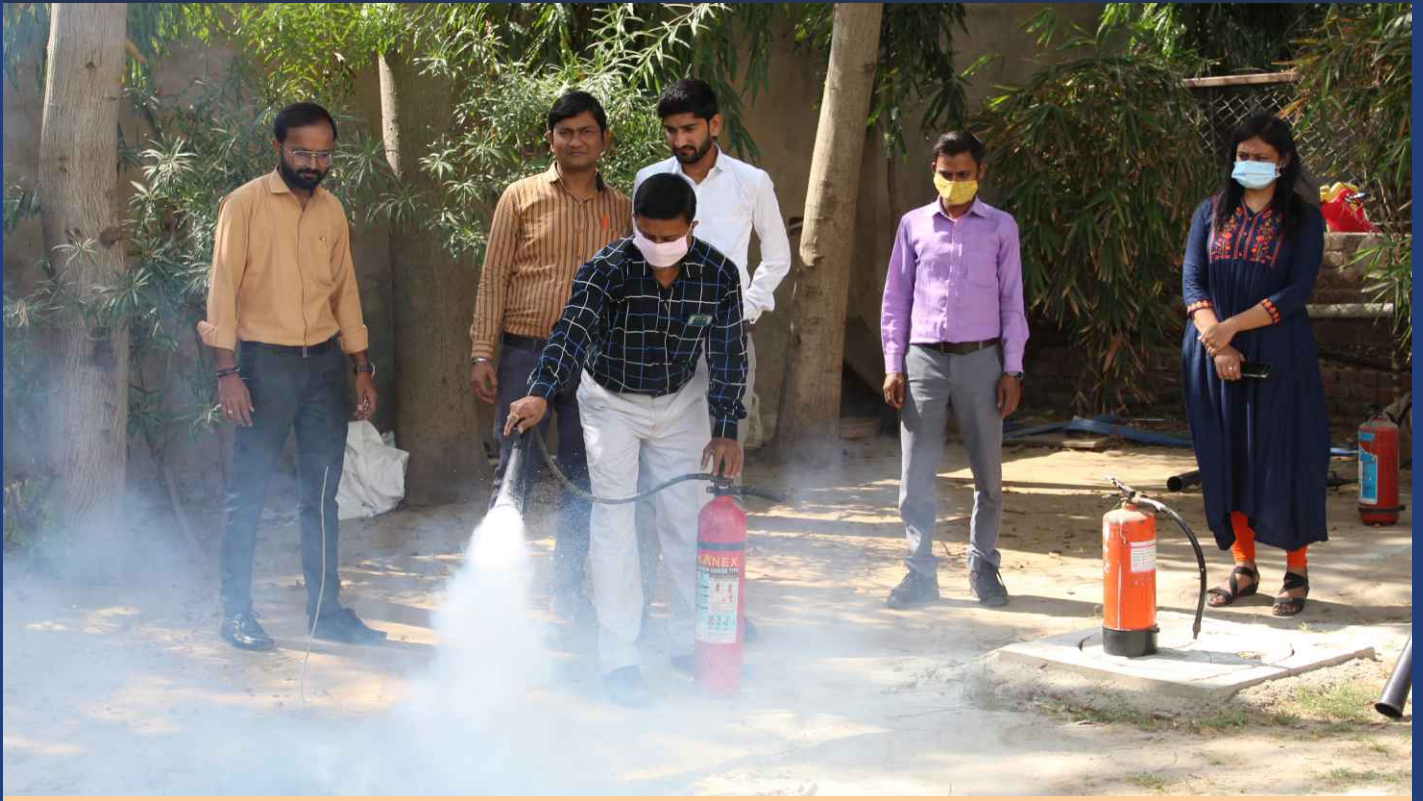
Fire safety Staff Training

SBS Ahmedabad had organized Fire Drill Training for the Students and Staff Members. In this training, they learned the usage of fire extinguishers in case of emergency, so that their own life and life of others can be protected in such extreme events.