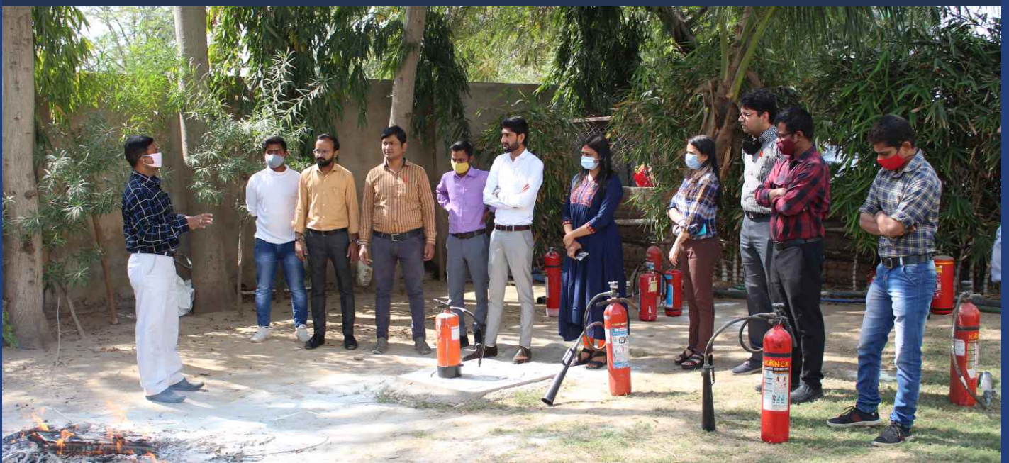
Staff and Students representatives