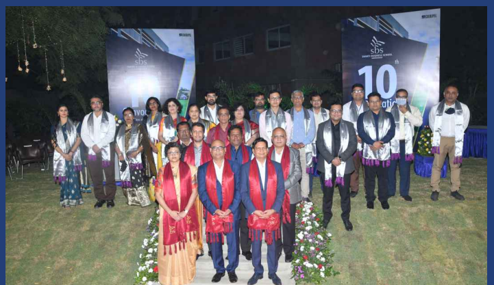
Chief Guest with GC Members and Faculty