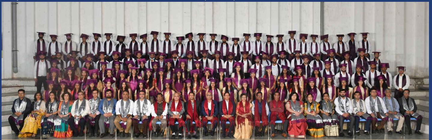
Graduating Candidates of 10 th Convocation with Chief Guest, GC members and Faculty.

Inspite of the Pandemic, students of SBS got placed in companies ITC, Deutsche Bank, MRF, Vivo, Knowcraft Analytics, Aditya Birla Fashion and Retail, Nestle India etc. with 100 percent placement.