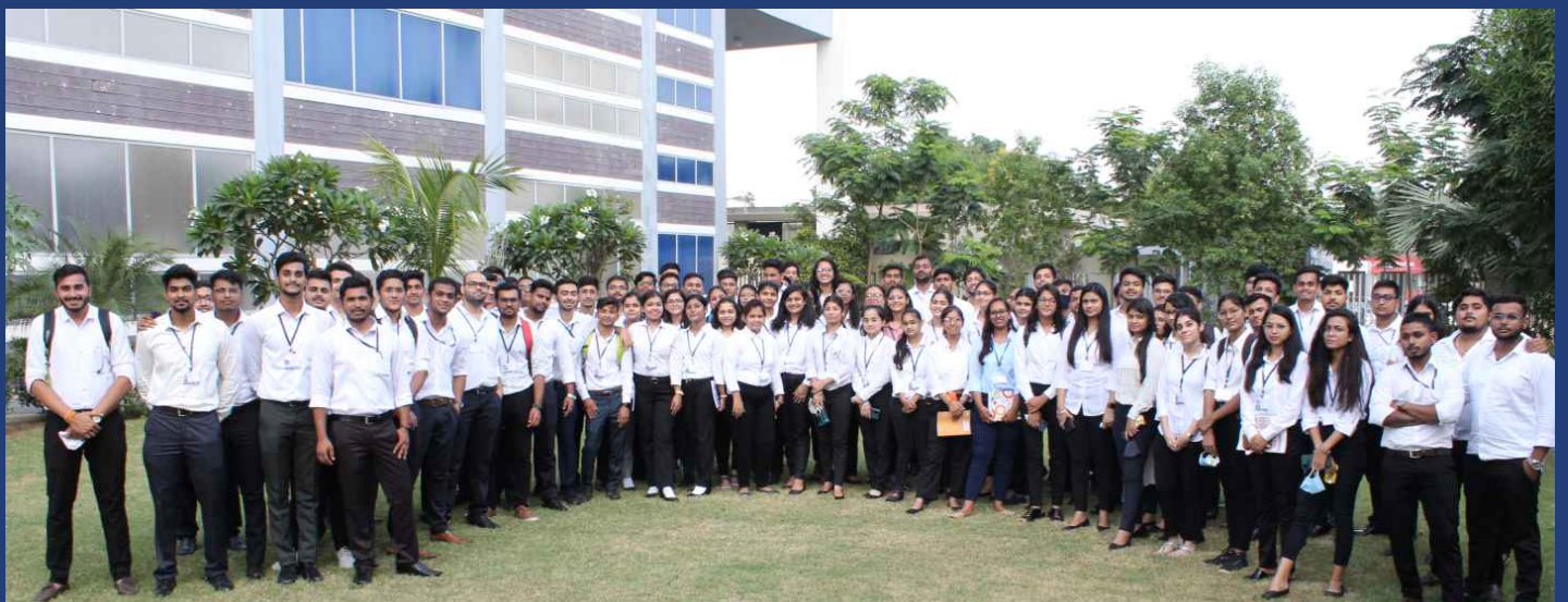
Students of batch 2021-23 during Orientation